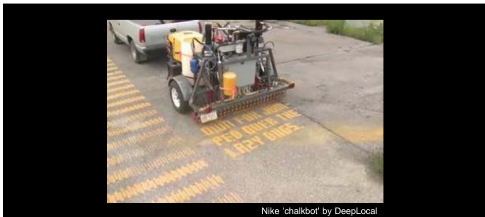
Nike 'chalkbot' by DeepLocal

Nike has teamed up with DeepLocal to blend the digital and physical worlds - by transferring online messages into chalk road murals along the route of the Tour de France.